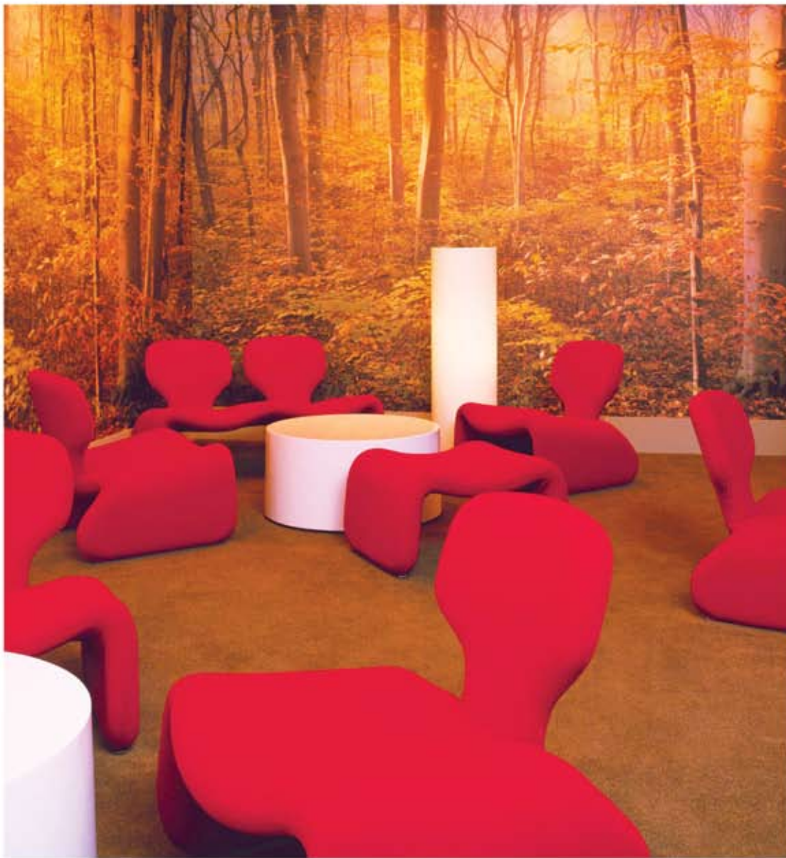
LEFT Flames of the forest. BELOW The only way is up. OPPOSITE PAGE Playing pool.